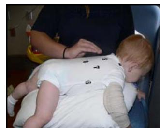
8 lying on stomach